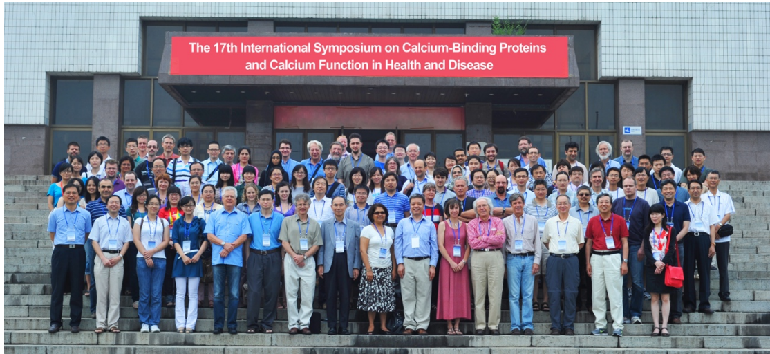
Co-organized with the Biophysical Society in 2011