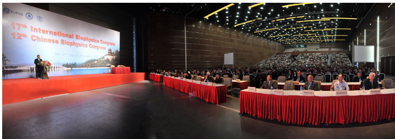
17 th International Biophysics Congress and the 12 th Chinese Biophysics Congress (2011, Beijing)

With the enhanced level of international collaboration, the Biophysical Society of China will continuously make efforts on exploring in-depth cooperation with more national societies to promote the prosperity and development of life sciences around the world.