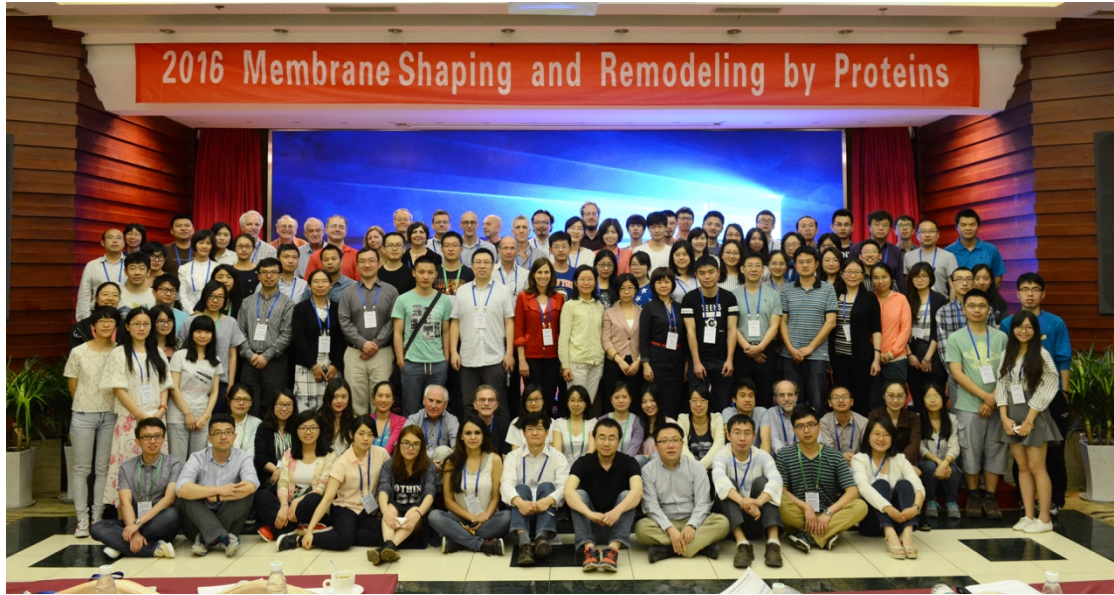
Co-organized with EMBO in 2016